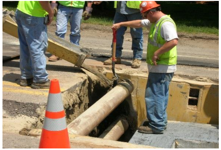
Photos above for informational purposes only, left to right: vault installation; backfilling vault

We thank you in advance for your understanding during this construction period.